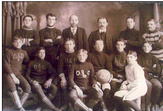
1903 "D & D" Senior Football Team