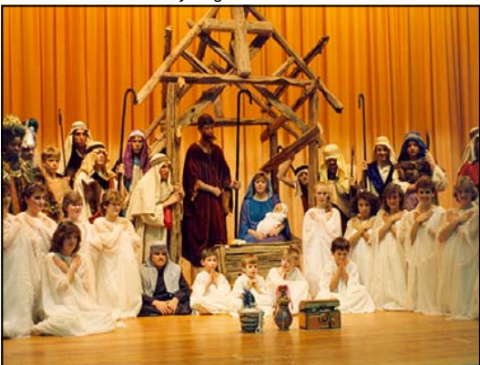
1987 Christmas Nativity Pageant

Fifty-four years later in 1928, this 1880 graduate unselfishly donated his treasured medal to the school's showroom.