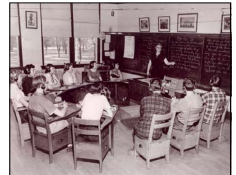
1954–1955 Senior Academic Class