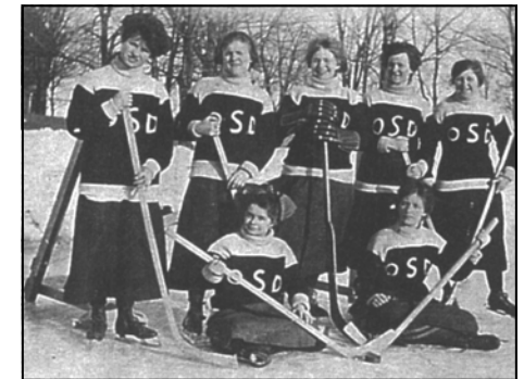
1919 Girls' Hockey Team

A special thank you is also extended to the alumni and former/current staff for their continued support and generous donations of school photos and so much more.