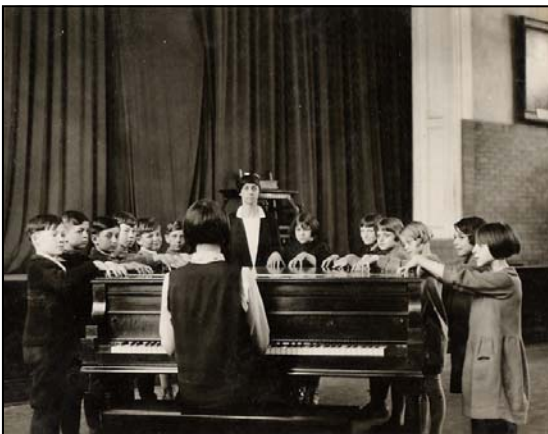
1927–1928 Rhythm Class

The Provincial Schools Branch of the Ontario Ministry of Education is responsible for the operation of the Sir James Whitney School for the Deaf and other Provincial and Demonstration Schools. For more information, visit www.psbnet.ca